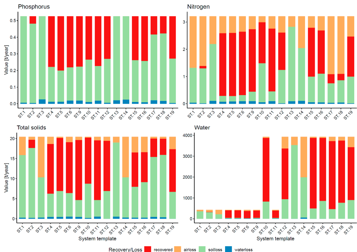
Figure 3. Stacked-bar graph of mass recovery and losses potentials for the selected systems per year.

The system with dry toilets, such as the system ID-57614 (ST-1), has a significant amount of leakage or evaporation in the technologies of FG-S (mainly single pits and vermicomposting). Also, some systems include only sinks that do not allow for recovery, resulting in zero recovery potential (e.g., ID-57614 from ST-1 and ID-63628 from ST-3). Nevertheless, if vermicomposting is combined with reuse of the final compost and reuse of the effluent for irrigation (e.g., ID-63628) then this system would allow recovering nutrients and organics safely, as total coliforms are said to be eliminated [45].