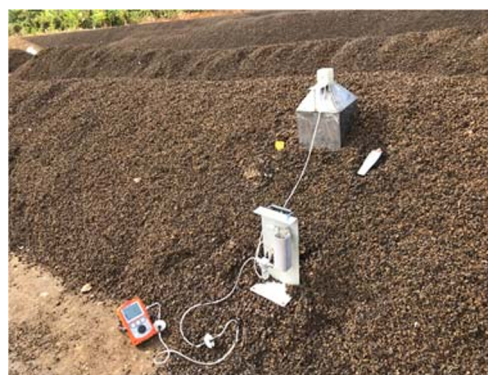
Fig. 2 Gas measurement at the Mill in Costa Rica

When the sampling device begins pumping, the sampling bag, made of Nalophan, absorbs the inner gas (Fig. 1). The upper part was uncovered allowing the ambient air to enter and to be mixed inside of the sampling hood. The gas collection was done weekly for a period of 30 min in order to collect 6 L of gas in a sampling bag. The gas samples were analyzed using Fourier-transform infrared spectroscopy (FTIR). Thereafter, the gas measurements were compared according to the previous study performed at the Mill in Costa Rica, where an open upper part sampling hood was used to measure the gas concentration by using a portable gas detector device (Fig. 2) (San Martin Ruiz et al. 2018).