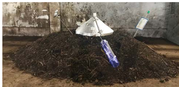
Fig. 1 Gas measurement at the composting plant facility

At the composting plant facility in Germany, an open upper part chamber was placed on top of the windrow piles and inserted approximately 5–10 cm deep into the windrow to seal the chamber against atmospheric influences in order to quantify the windrow emissions focusing on CH 4 measurements. At each sampling event, the sample was taken from at the top of the windrow