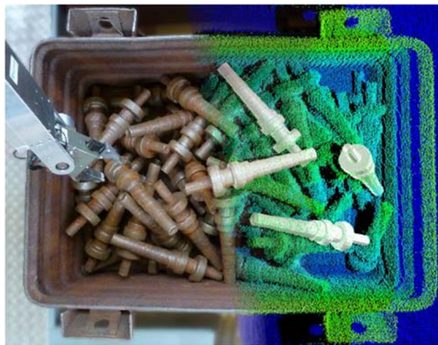
Fig. 2 Cluttered scene for bin-picking

Pose estimation challenges [49, 50] and standard benchmarking systems [51] for pose estimation allow advancing the state of the art and enable a transparent and fair comparison of different approaches. Especially, the robust pose estimation of multiple objects in bulk is a great challenge and of major importance. These scenarios, which are often present in industrial bin-picking scenarios, are challenging due to a high amount of clutter and occlusion as visualized