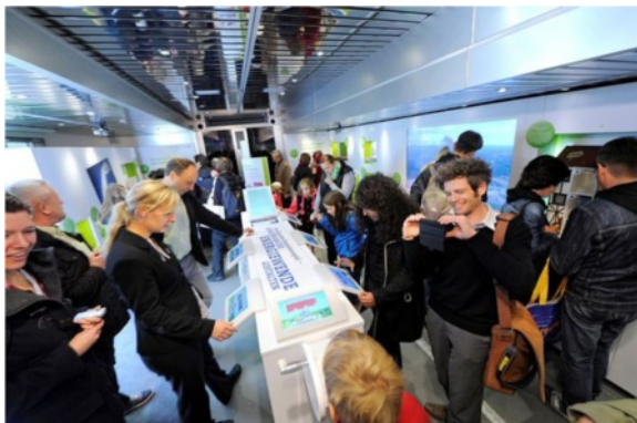
Fig. 10 Big event on the German National Day

The main lesson from the exhibition has been that given a well-balanced mix of basic information, opportunities for self-experimentation and reflection, quizzes and tests, as well as role playing for enabling visitors to exchange their impressions with others proved to be very attractive (more than 80 % gave highly favorable reviews of the exhibition 14 ) and also very productive with respect to knowledge acquisition and personal learning.