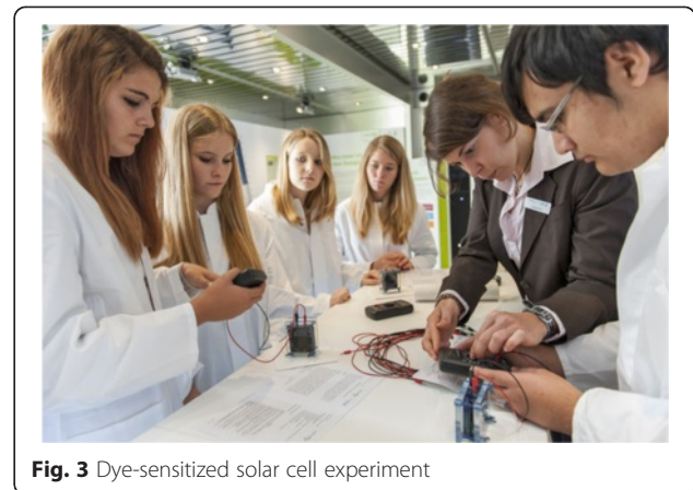
Fig. 3 Dye-sensitized solar cell experiment

More interestingly, visitors can freely choose and change roles in the energy system—consumer, supplier, or regulator—enabling them to see divergent views on particular topics and interact virtually with the other roles. In the energy transition, the three roles might face dissimilar aims, challenges, and tasks for energy production, consumption, and storage. Visitors could identify with a specific role and learn corresponding options and impacts on the energy system. In reality, everyone has a role in the energy system, but being aware of other standpoints and responsibilities could put citizens at ease when dealing with the unknown future. For group visits, especially for school students, the tour supports