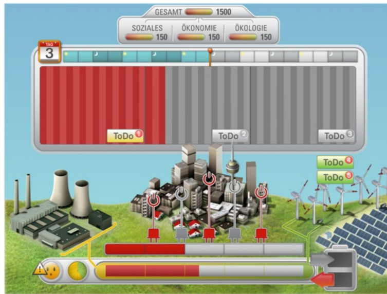
Fig. 7 User interface of electricity generator

individual decisions to use appliances at each moment in their own display. It reminds visitors of their daily consumptions in reality.