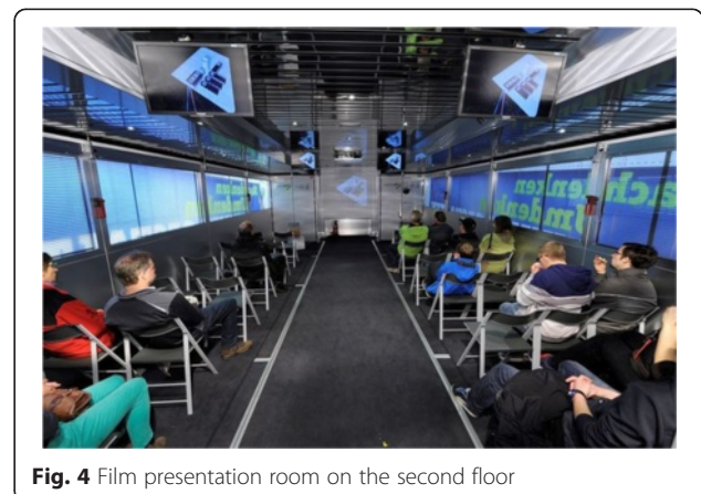
Fig. 4 Film presentation room on the second floor