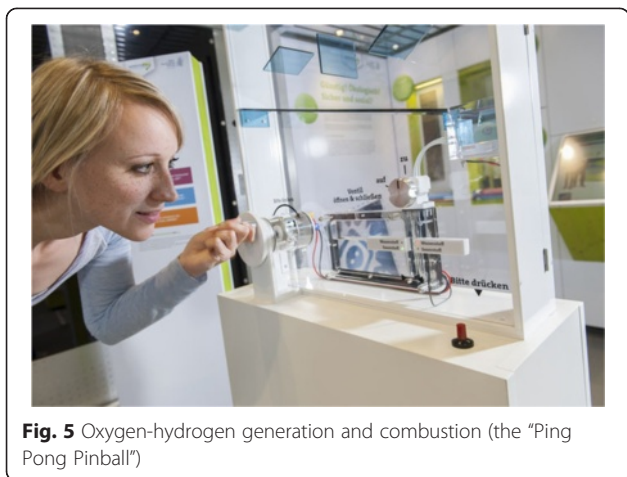
Fig. 5 Oxygen-hydrogen generation and combustion (the "Ping Pong Pinball")

the interactive simulation game aimed to make the idea more accessible and memorable and to stimulate visitors' curiosity and desire to give it a try. The game was designed to increase citizens' awareness and heighten a sense of individual responsibility. Personal responsibility is an important component to engage people in environmental conservation actions, which should be considered well in promoting programs [6]. Generally, museums and science lessons present physical facts about energy technologies, while this mobile exhibition brings out the social aspects of energy issues and the need for collective action. The interactive game can help visitors make better connections between their electricity consumption and personal impact on the energy system, unlike illustrations of home appliance choices, which focus on the efficiency of the device, rather than the actions of the user. Additionally, it allows visitors to experience new roles, such as prosumer with this simulation. By experimenting with