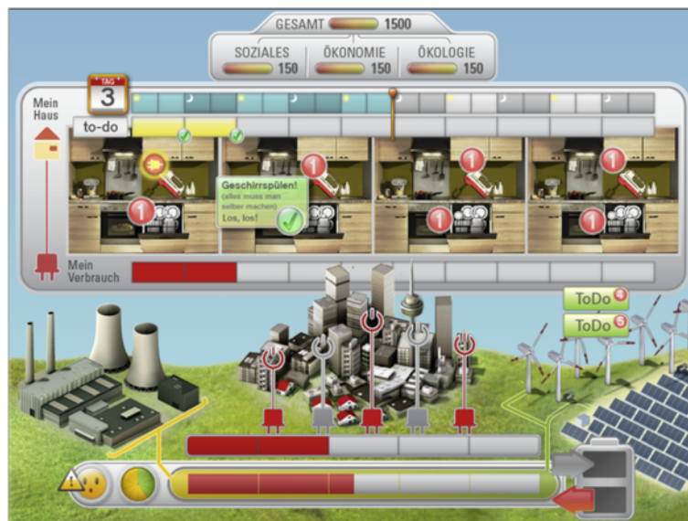
Fig. 8 User interface of electricity consumer

electricity produced and consumed (see Fig. 7), and consumers know their consumption conditions after using certain appliances from their own screens (see Fig. 8). Unlike the traditional grid, the smart grid here in the game makes consumers aware of the whole supply and demand system in addition to their own consumption. When the consumption level is high, the generator either provides more electricity, or a blackout happens, which brings that round of the game to an end. To achieve a better score, groups could play a second or third round. An open discussion on possible ways to balance demand and supply in the virtual city is encouraged