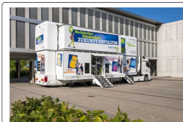
Fig. 2 The new appearance of the Expedition N vehicle after its redesign

Two of the authors (IC and OR) redesigned the Expedition N to facilitate the integration of citizens into the new energy regime of Germany. By using the information terminals of the exhibition, citizens use their own interests and learning process to understand the function of the electricity grid, how they would affect the grid as consumers or energy producers, as well as the dynamics of the smart grid in resource allocation. The smart grid concept is not well understood by most people outside the relevant technology industries; therefore,